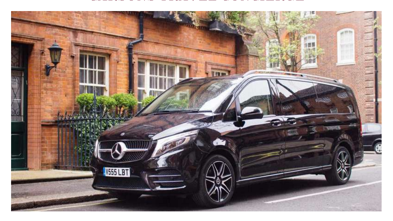
Thursday, May 9 and Friday, May 10